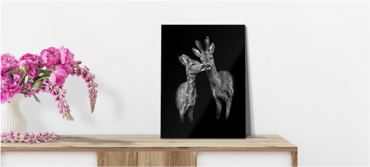
Der Kuss © Claudio Gotsch, lumas.com